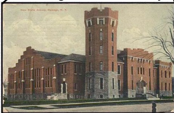
New State Armory, Oswego, NY

Oswego YMCA, 249 west 1st St., Oswego NY, 13126, PH: 315-343-1981