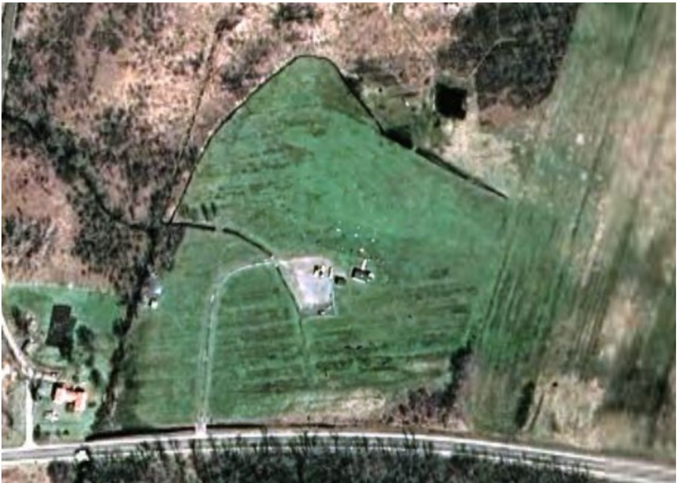
STARS Field Satellite photo